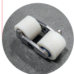
White tandem wheels for a high level of hygiene