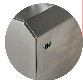
Waterproof stainless steel cover