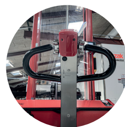
Ergonomically correct handle