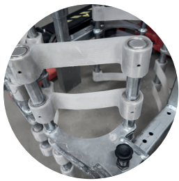
Specially developed polyurethane gripping pads

Handles steel, plastic, small, low, high, square, round drums, from Ø300 mm to Ø600 mm