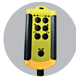
Remote control for electric clamping, lifting, lowering, and rotation

Secured against opening by mistake (two-button-function)